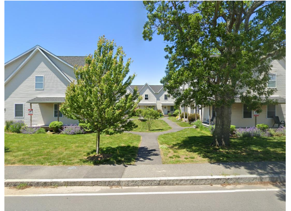
57 Ridgewood Avenue, Hyannis