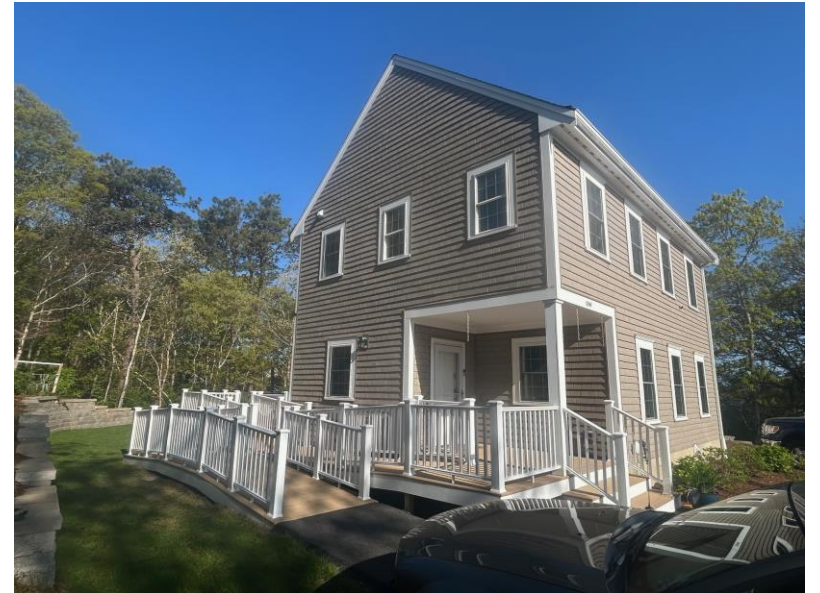
CIVOC Veterans Home, Dennis

Development activities include land acquisition, new construction, redevelopment of existing buildings, conversion of market units to affordable housing units and mixed-use development.