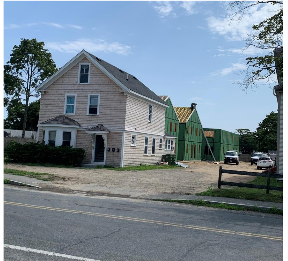
50 Yarmouth Road, Hyannis